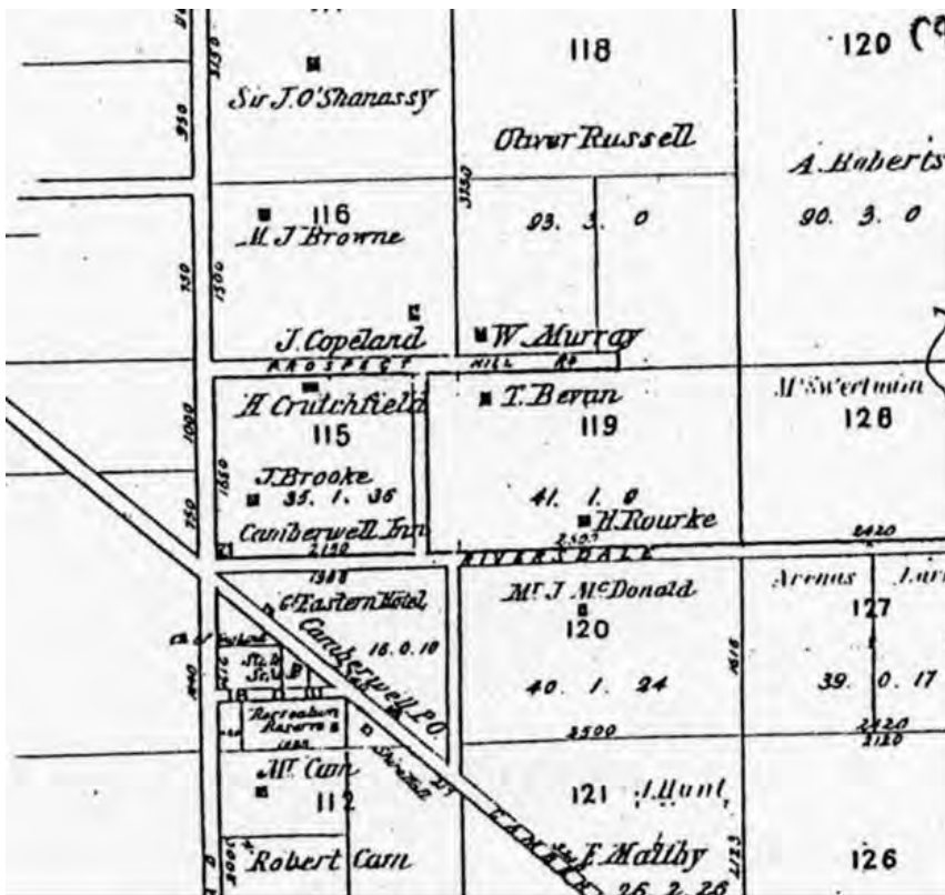
Figure 4: Boroondara Shire Map, 1871